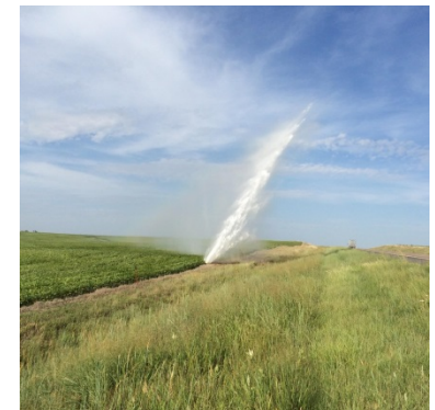
Please call us if you see this.

If you experience high pressure or any change please let us know immediately. The District strives to better serve its patrons with 24 hour service. Please call the District office at 785.472.4486 and listen to the options, select option 9 to be connected to the after-hours emergency dispatcher